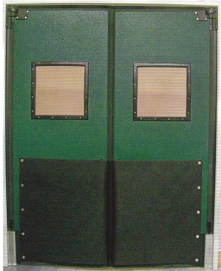
Doors shown with optional tear drop bumper system

This fully gasketed door system is excellent for areas that need to be kept cold or dust and debris free. Excellent for use in freezer and cooler applications. The Ruff Tuff door system is strong and durable, yet decorative and attractive.